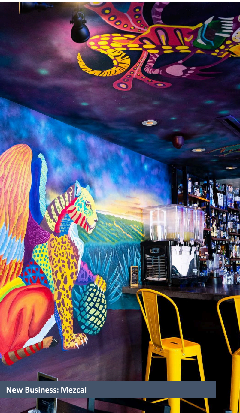
New Business: Mezcal