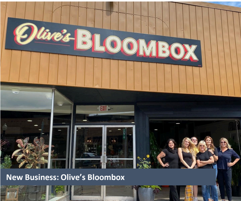
New Business: Olive's Bloombox