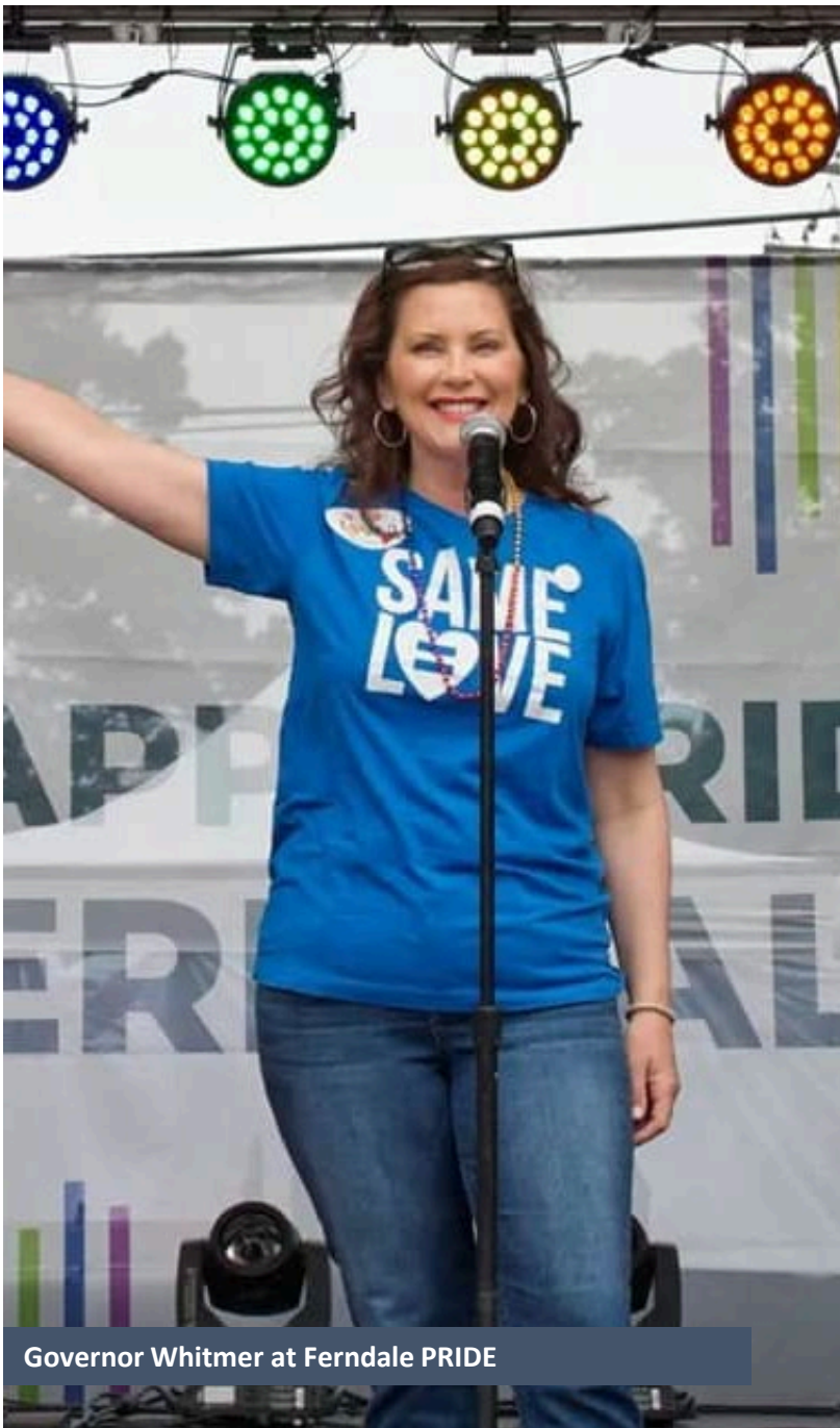
Governor Whitmer at Ferndale PRIDE