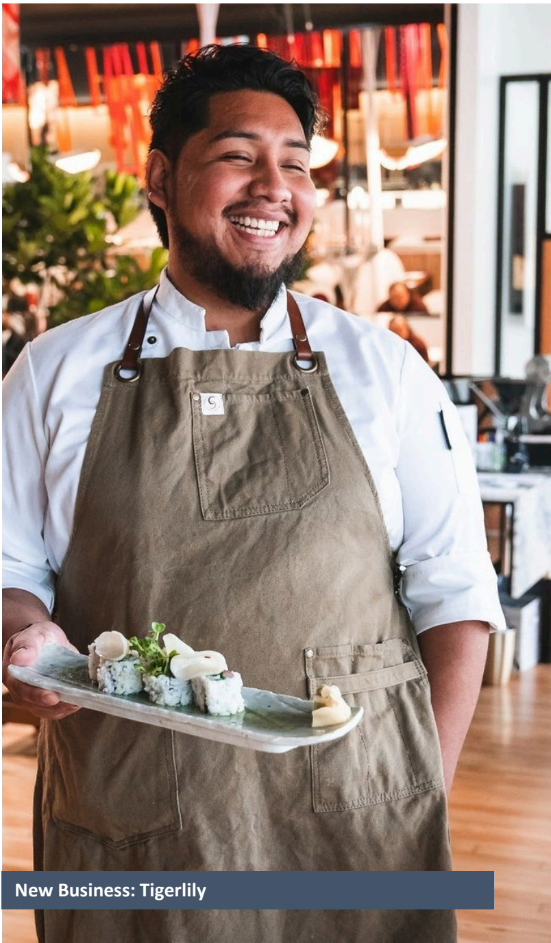
New Business: Tigerlily