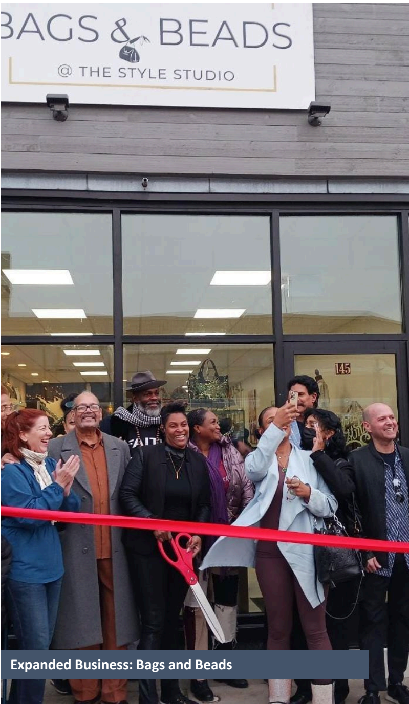
Expanded Business: Bags and Beads