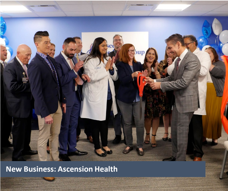
New Business: Ascension Health