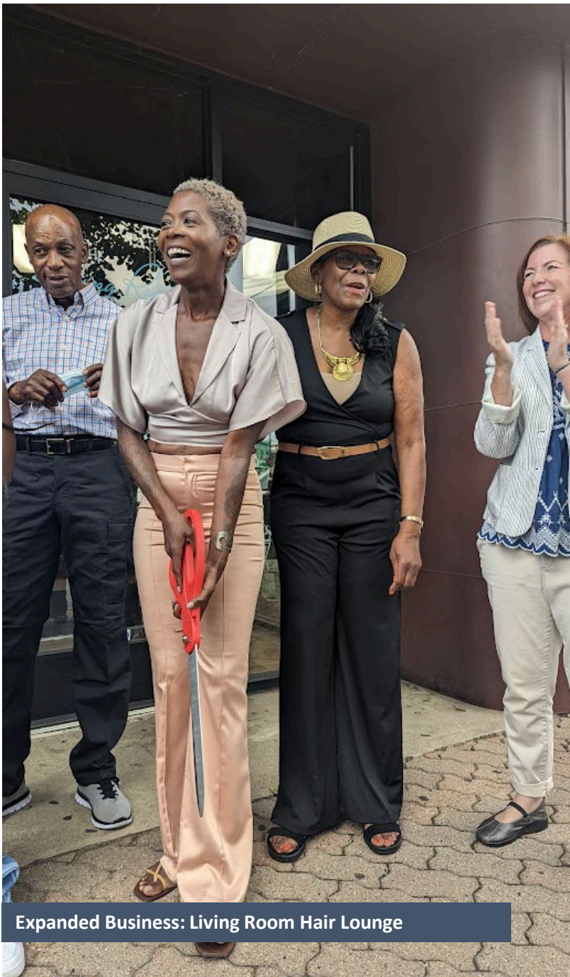
Expanded Business: Living Room Hair Lounge