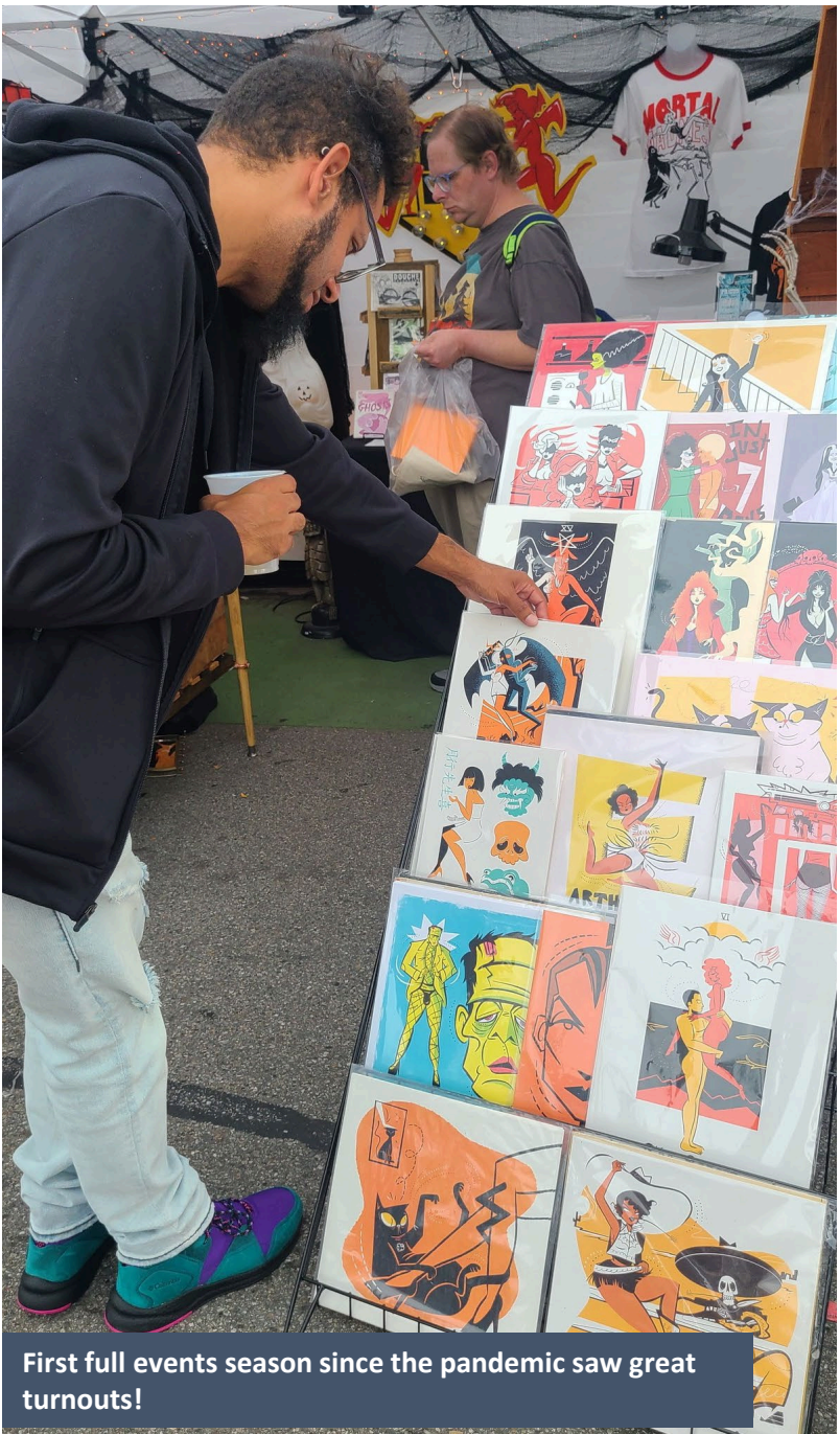
First full events season since the pandemic saw great turnouts!